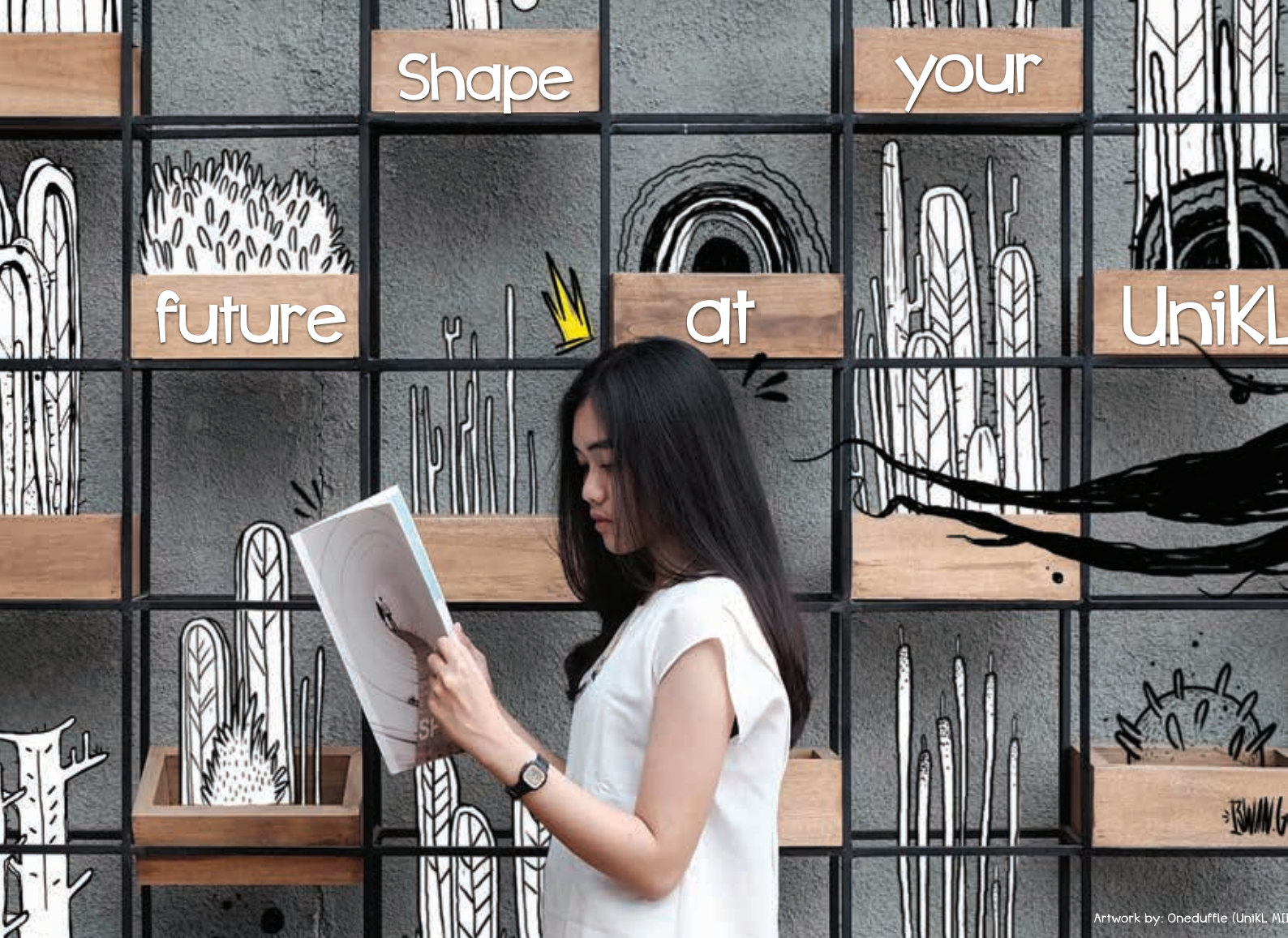
Artwork by: Oneduffle (Unikl MID)